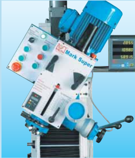
Head swivels \pm 45^\circ

Dovetail guide and motorized cutter head height adjustment provide for a wide variety of applications